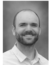
James Sylvester Fine Arts